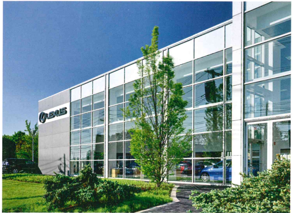
Westchester Lexus—White Plains, N.Y.