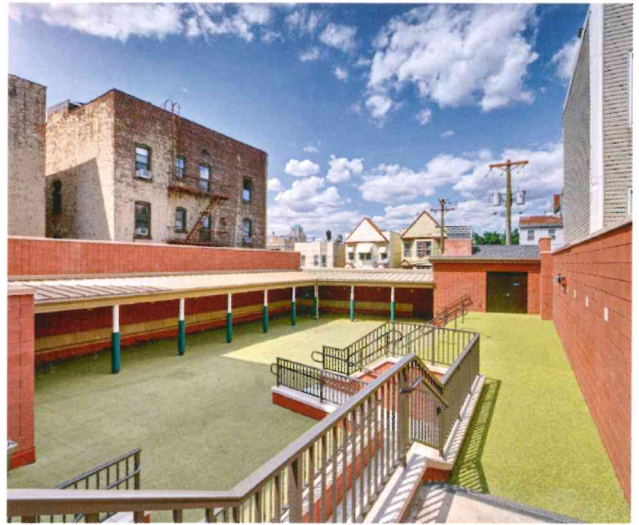
Saint Elizabeth, Jersey City, New Jersey

The playground was built from the ground up and contains stairwells, a handicap ramp, a unisex restroom, and features a rubberized playground surface covering the entire courtyard to ensure the safety of the children playing in the area. The outdoor space also includes a partial peristyle, which serves as a canopy with seating underneath for audiences enjoying outdoor performances in the courtyard. The entire exterior is comprised of soft tile and brick, creating a modern architectural aesthetic.