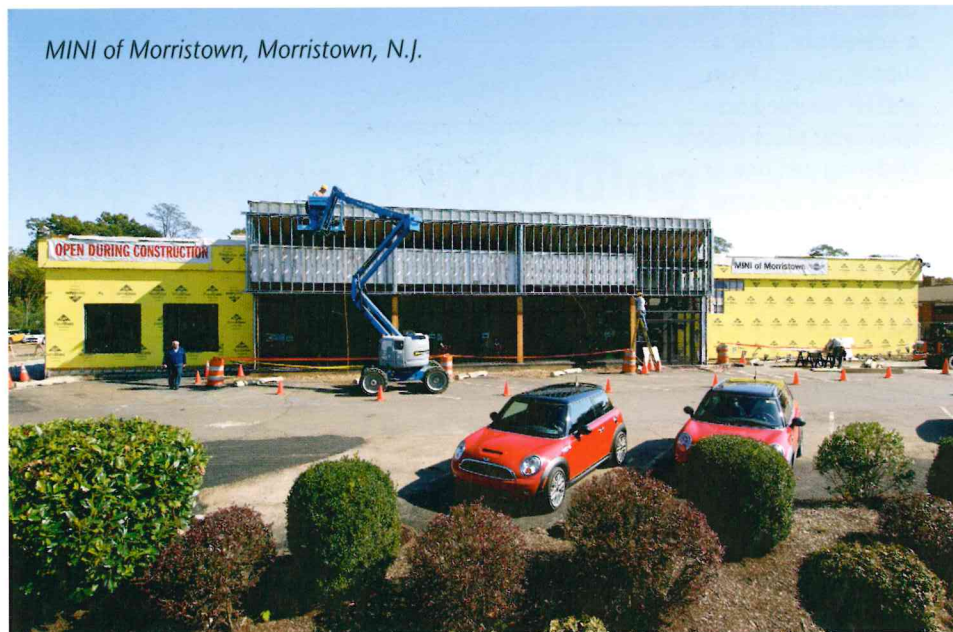
MINI of Morristown, Morristown, N.J.