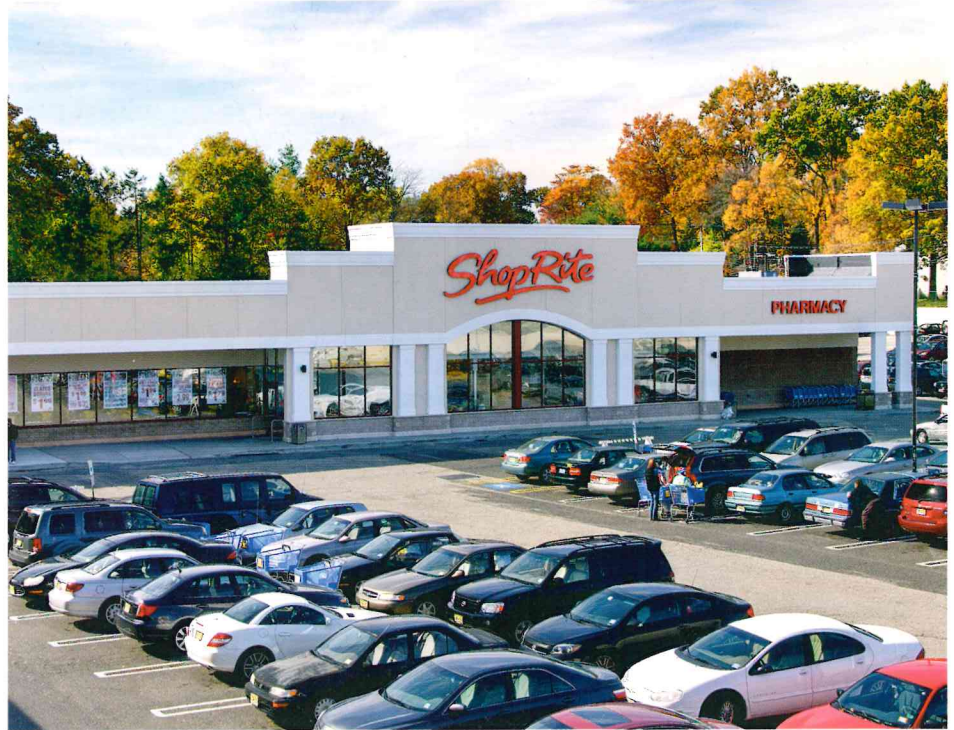
ShopRite of Emerson, Emerson, N.J.