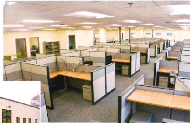
Praxair's newly-renovated call center.

Praxair is the largest supplier of industrial gases in North and South America. Visit their website at www.praxair.com