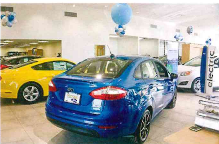
The new showroom.

K lae Construction recently completed new additions and renovations for Beyer Ford on Ridgedale Avenue in Morristown, N.J. Beyer Ford is a local, family-run business that was originally formed in 1914 as Beyer Bros., a bicycle repair shop. Over the next five decades, the company grew to a gas station and then a vehicle repair shop. In 1964 the family expanded to operating as a GMC truck franchise, and in 2011 purchased the Warnock family's Ford dealership.