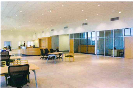
The sales department.