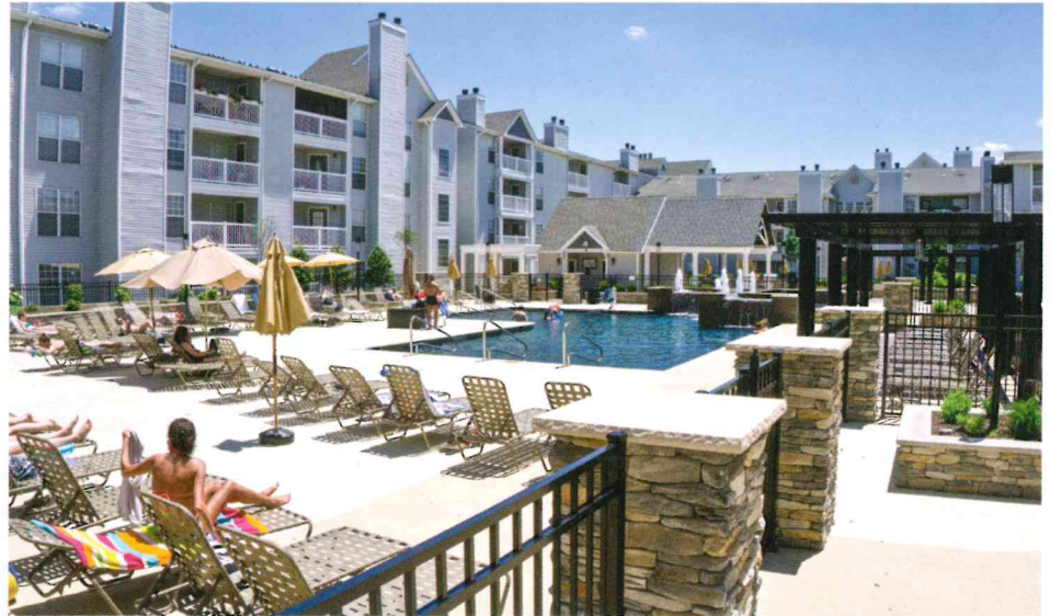
Klæ Construction had to hoist the building materials over the four-story structures during the renovation of the four interior courtyards for Mountain View Crossing in Wayne, N.J.