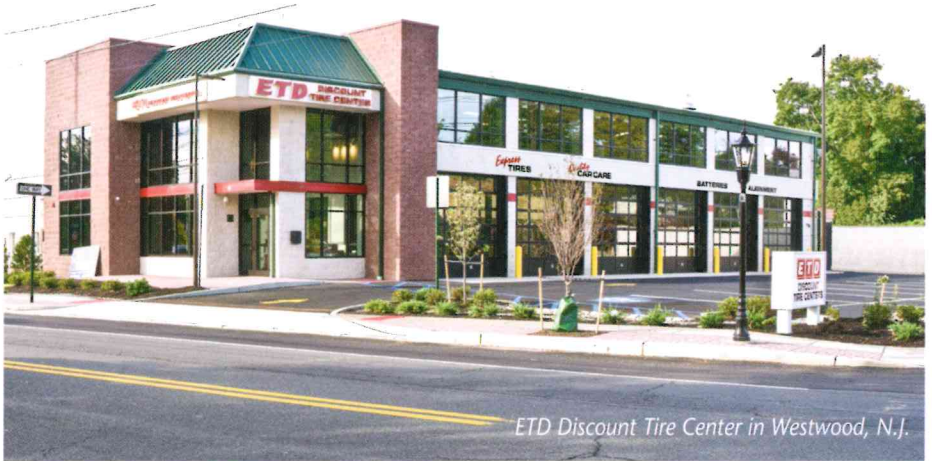
ETD Discount Tire Center in Westwood, N.J.

This is the fourth facility Klæe Construction has completed for Englewood Tire Distributors.