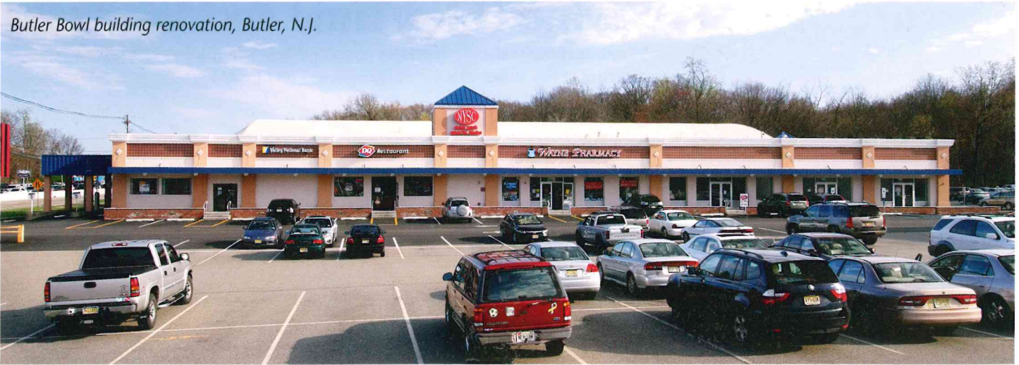
Butler Bowl building renovation, Butler, N.J.