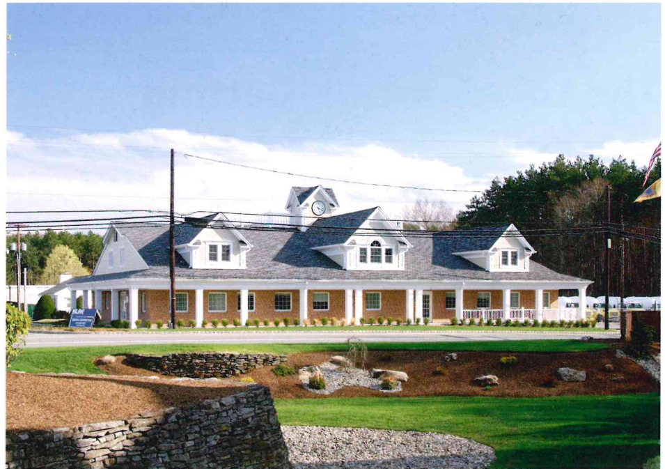
Eastern Propane, Oak Ridge, N.J.